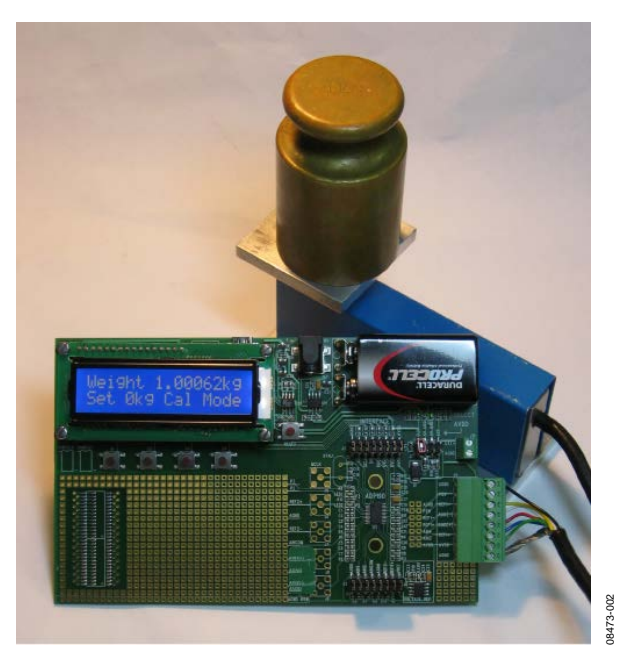
Figure 2. Weigh Scale System Using the AD7191

Figure 2 shows the actual test setup. A 6-wire load cell is used, as this gives the optimum system performance. A 6-wire load cell has two sense pins in addition to the excitation, ground, and two output connections. These sense pins are connected to the high side and low side of the Wheatstone bridge. The voltage developed across the bridge can, therefore, be accurately measured. In addition, the AD7191 has differential analog inputs and accepts a differential reference. Connection of the load cell differential SENSE lines to the AD7191 reference inputs creates a ratiometric configuration that is immune to low frequency changes in the power supply excitation voltage. With a 4-wire load cell the sense pins are not present, and the ADC reference pins are connected to the excitation voltage and ground. With this arrangement, the system is not completely ratiometric because there will be a voltage drop between the excitation voltage and SENSE+ due to wiring resistance. There will also be a voltage drop due to wire resistance on the low side.